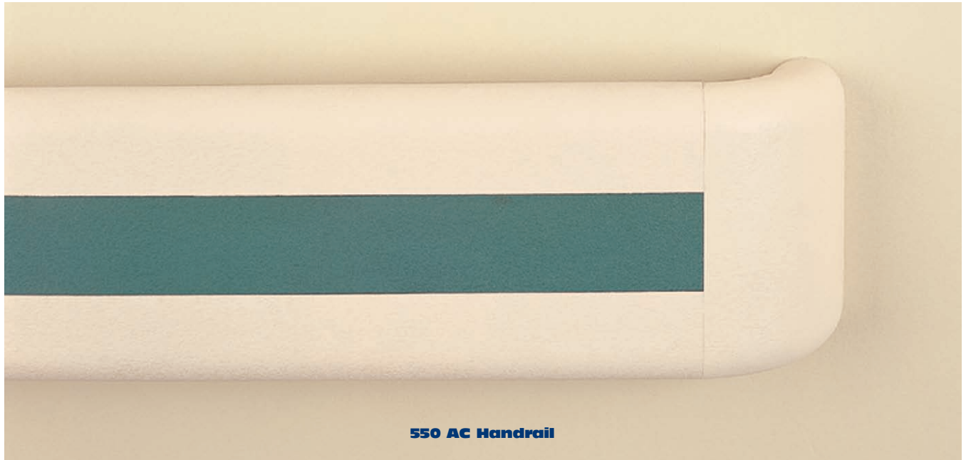
550 AC Handrail

NELPLAS 550 AC Handrails is a 5-1/2" (139.7mm) rails with full-length vinyl bumpers and continuous aluminum retainers. A 2" (50.8mm) accent strip is added to the profile extrusion to add contrast and design options. The accent strip in the 550 AC Handrail is a solid color. The 550 AC Handrail is ideal for medium- to high-impact areas, and the 550 AC Handrail is best suited for low-impact areas. End and corner caps are available either as patented foam cushion or as rigid plastic. Optional reveals, available for both foam cushion and rigid plastic end and corner caps, provide additional design options.